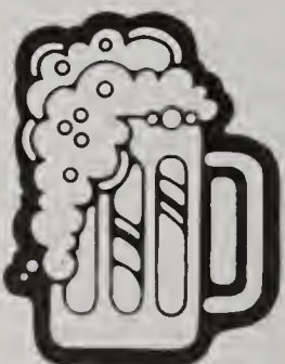
12 oz. beer